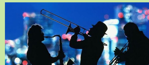
This concert series is funded by the UJA Jeannette Solomon Fund